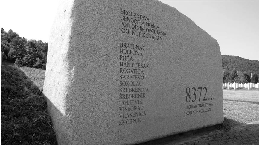
2.1 Plaque inside the cemetery portion of the Srebrenica Memorial, Laura Beth Cohen, July 2012.

systematically executed. 13 Women and girls were forcibly bused to Tuzla, located in the then free territory controlled by the Army of Bosnia i Hercegovina (ARBiH).