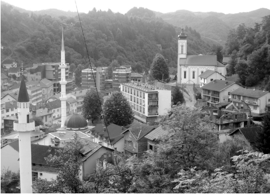
2.2 Contemporary Srebrenica

atmosphere, including genocide denial, is very much alive, especially in the days and weeks leading up to the annual 11 July commemoration as well as during elections, when politicians dredge up the war's wounds for their own personal gain. Seeing the Srebrenica Memorial through a different lens—one that acknowledges the complex political environment in which it operates and contributes—is therefore key.