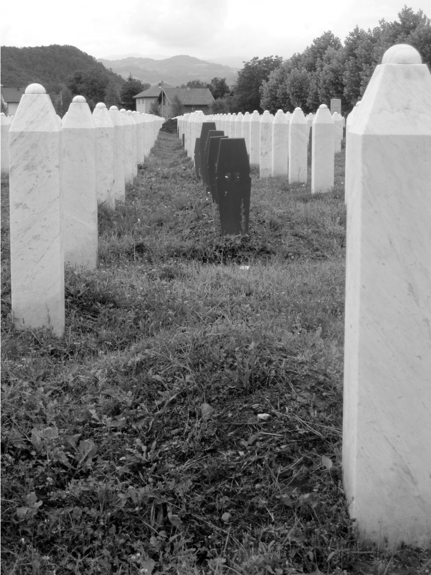
2.3 Green temporary grave markers, Srebrenica, July 2011.