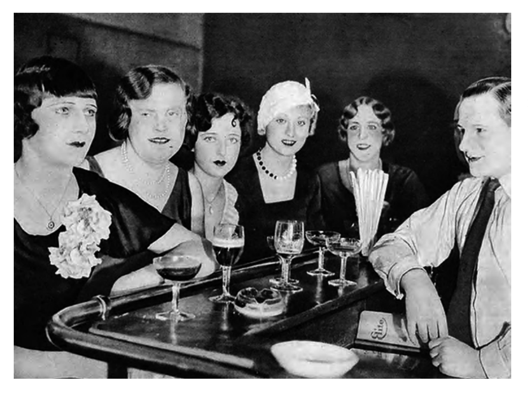
FIGURE 3.8: The Eldorado

He later praised Meerscheidt-Hüllessem as a "champion of light and justice" who "with word and deed selflessly stood by hundreds and saved many of them from shame and death," and he described Hans von Tresckow as having "saved hundreds of homosexual men from despair and suicide" by prosecuting their blackmailers.<sup>34</sup> The close cooperation between sexologists/ activists and the police is best exemplified in Hirschfeld's creation of what he called "transvestite passes" - certified pieces of identification that were recognized by the Berlin police department and that therefore protected cross-dressers from arrest under laws against "causing a public nuisance" or impersonation.