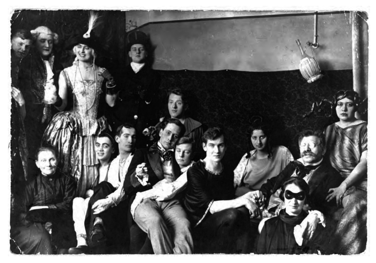
FIGURE 3.6: The Institute of Sexual Science as refuge ca. 1919.