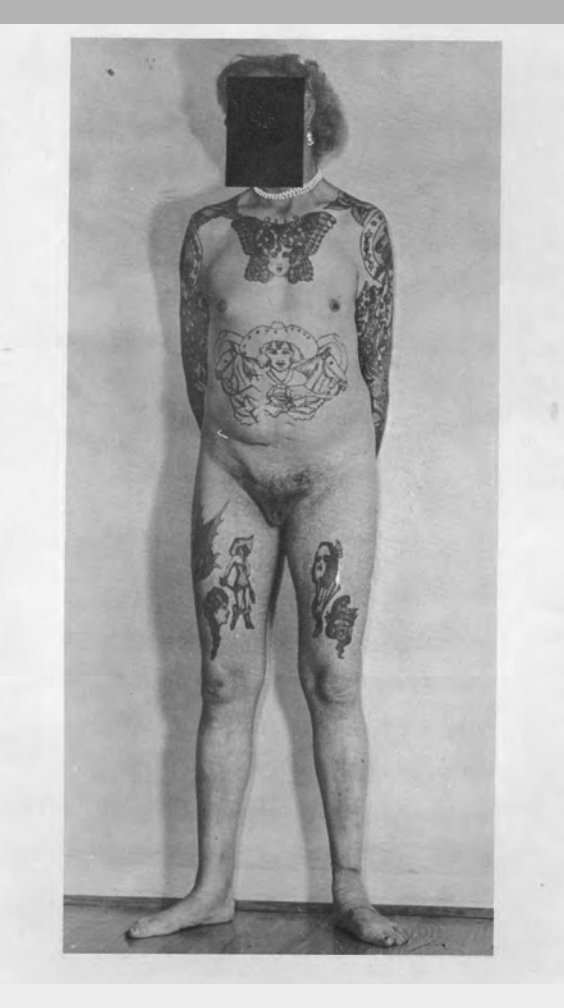
FIGURE 3.3 and 3.4: Left and right pages from the special image supplement to The Transsexual Phenomenon , 1966. Caption: "45-year-old, masculine-looking male transsexual, before sex reassignment operation. Note hypogonadal state. Tattoos were acquired in futile attempt to masculinize himself. After failure to do so, he began to live and work as a woman. Conversion operation was in 1953 (at age 45). Since then, patient has led a reasonably contented life as a woman (see case history in Chapter 7, Part II)."

45-year-old, masculine-looking male transsexual, before sex reassignment operation. Note hypogonadal state. Tattoos were acquired in futile attempt to masculinize himself. After failure to do so, he began to live and work as a woman. Conversion operation was in 1953 (at age 45). Since then, patient has led a reasonably contented life as a woman (see case history in Chapter 7, Part II).