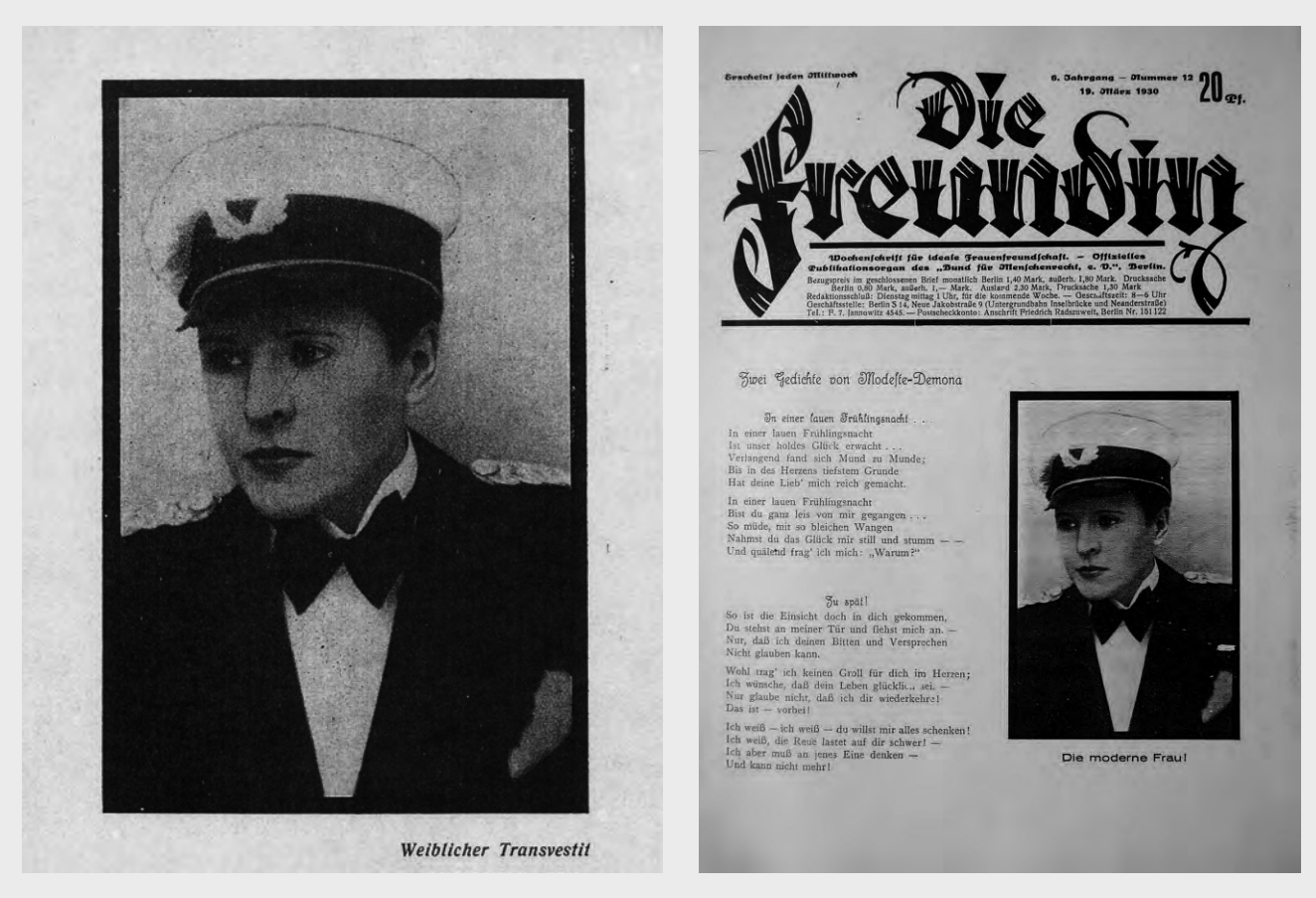
FIGURE 3.16: "Female transvestite" in Das 3. Geschlecht .

FIGURE 3.17: Cover of Die Freundin (March 19, 1930), captioned "The modern woman."