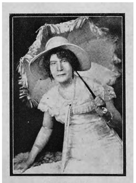
Ein bekannter New Yorker Transvestit

But there were even more direct and personal conduits for this transatlantic transmission of information. It is clear that