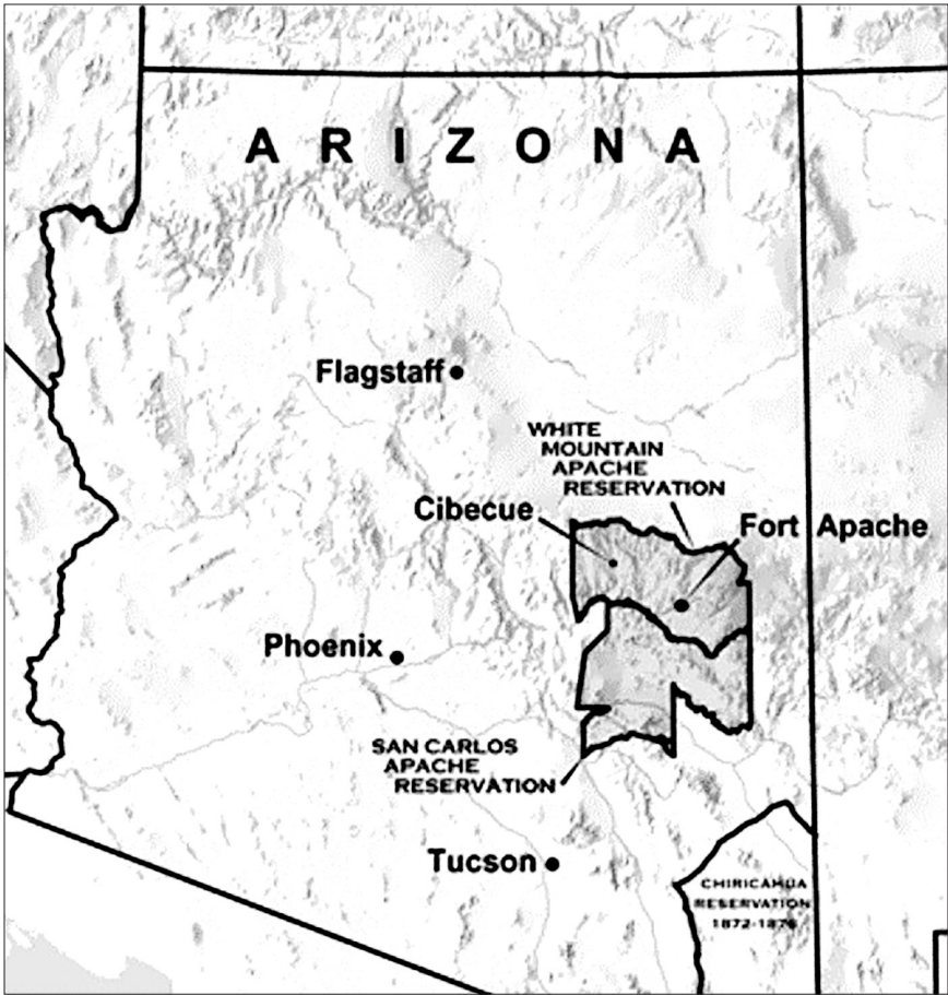
FIGURE 3.1: White Mountain and San Carlos Apache reservations, including the location of the Fort Apache and Theodore Roosevelt School National Historic Landmark.

(Navajo) lands to the north occupied the soldiers' barracks and bunks. 7 By the later 1920s, as schools were built on Dine lands for Dine kids, Hopi, Pima, Yuma, and Apache children were transported to the erstwhile Fort Apache. The United States changed the place's name to Theodore Roosevelt School (T.R. School), replacing the soldiers and their guns with civilian bureaucrats and educators bearing almost equally dangerous policies.