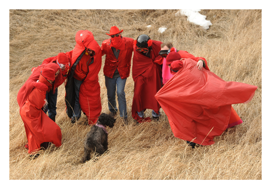
FIGURE 12.4. VIGILANCE