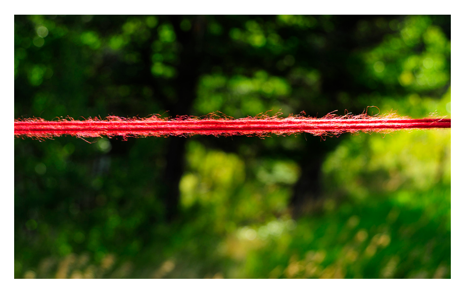
FIGURE 12.6. THE RED LINE