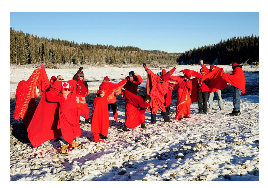
Figure 12.3. GRIEF AND ANGER