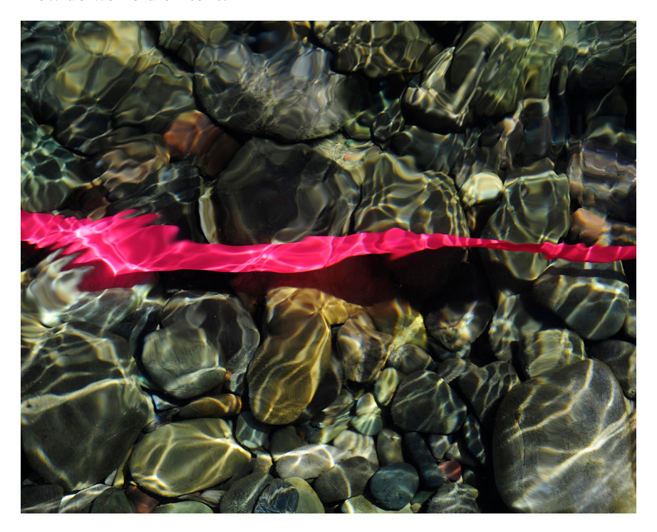
FIGURE 12.8. LINE OF CLARITY

A sharp line of survey tape (see Figure 12.8) in the water notes purity and clarity. When did you last see a river like this? What is the line of clarity? How do we hold on to it?