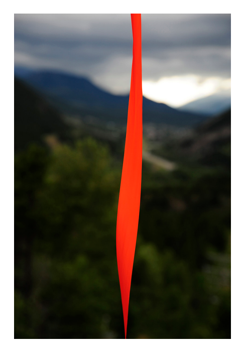
FIGURE 12.5. TENSION