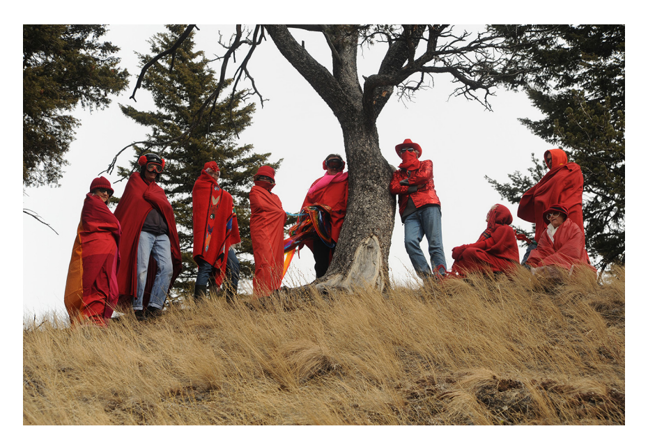
FIGURE 12.1. THE WATCH