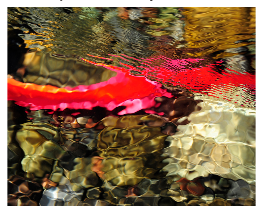
FIGURE 12.9. LIMITATIONS

Sometimes we do not know natural limitations until they have been reached. Then it is too late. Figure 12.9 depicts this truth. All over the world, major cities are trying to buy back their watersheds. It is expensive. It takes time. Our waterways are vulnerable. Legislation would protect them. We need public will to create that legislation.