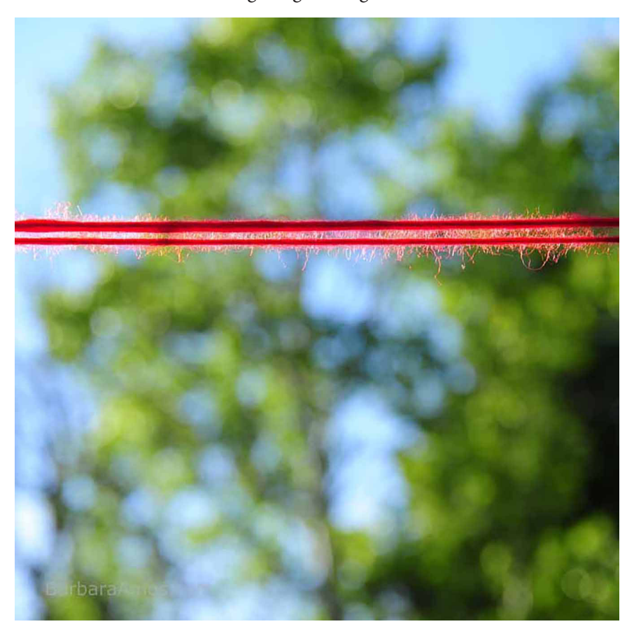
FIGURE 12.12. NEW HORIZONS

There is uncertainty as we look to new horizons (see Figure 12.12). We need to remember that change might bring us a better world.