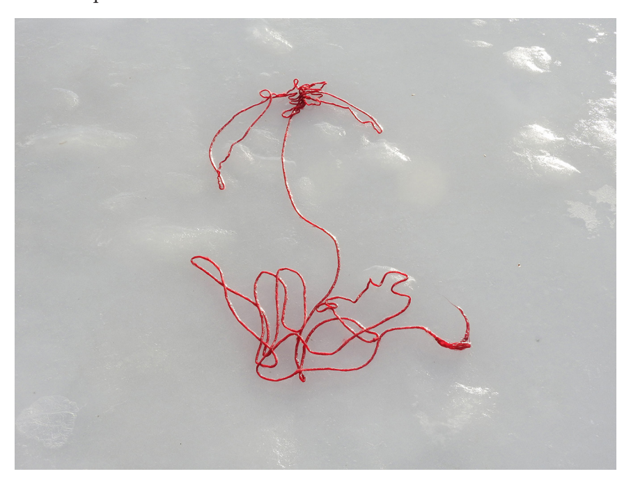
FIGURE 12.11. ICE PETROGLYPH

What will those in future generations think of our era? Figure 12.11 invites the question.