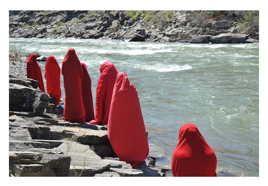
Figure 12.2. THE GUARDIANS