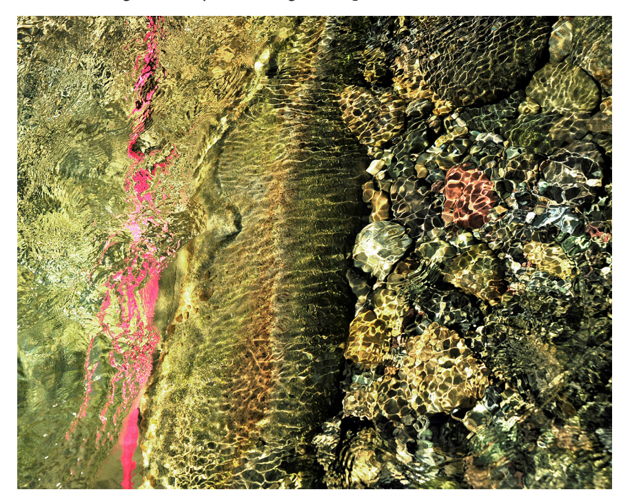
FIGURE 12.10. CHANGE

Water creates everything. It changes everything. Water is an essential to life. It is limited. It is viewed by many as a resource. Resources are viewed as commodities in our present world. Resources are regulated, permitted, bought, and sold. We need a different approach for water. We need to protect our water. It is so beautiful (see Figure 12.10). It makes me wonder. Can we change in a way that brings us hope?